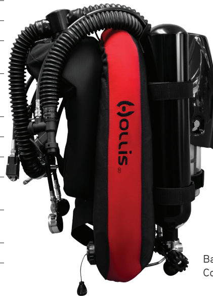
Back-Mounted Counter Lung