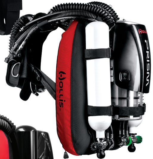
Front-Mounted Counter Lung